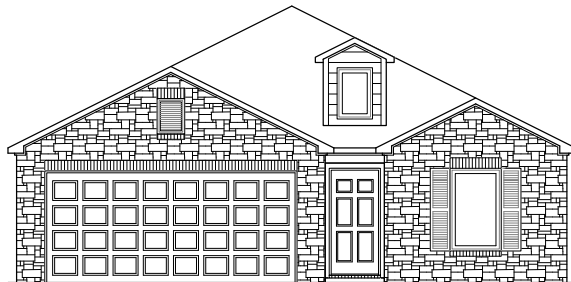
RC Westbrook Elevation E