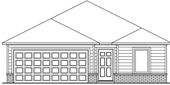
RC Westbrook Elevation A