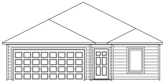
RC Westbrook Elevation G