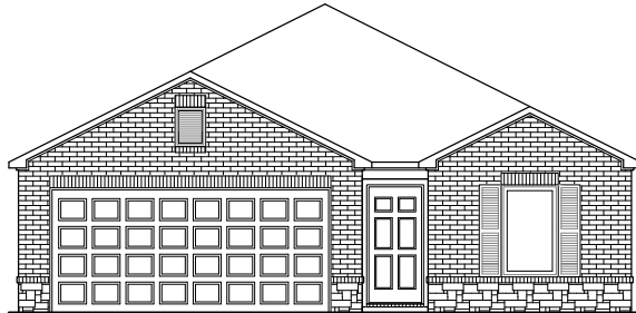
RC Westbrook Elevation D