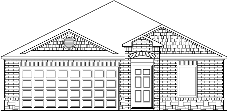
RC Hudson Elevation C