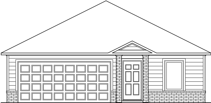
RC Hudson Elevation A