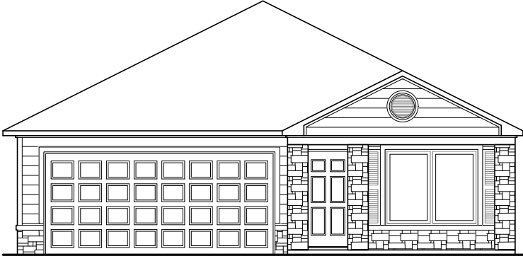
RC Hudson Elevation I