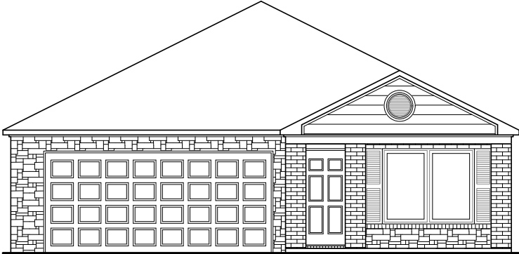
RC Hudson Elevation D