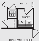
OPT. HVAC CLOSET