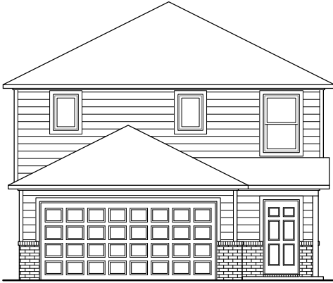
RC Holland Elevation A