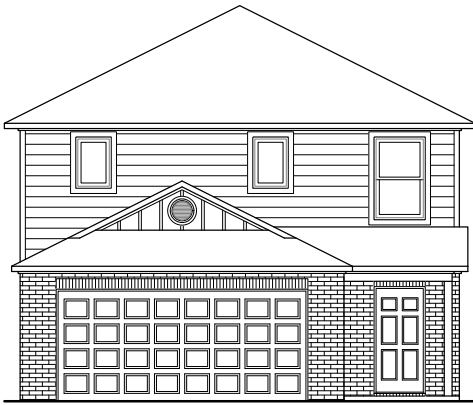
RC Holland Elevation C