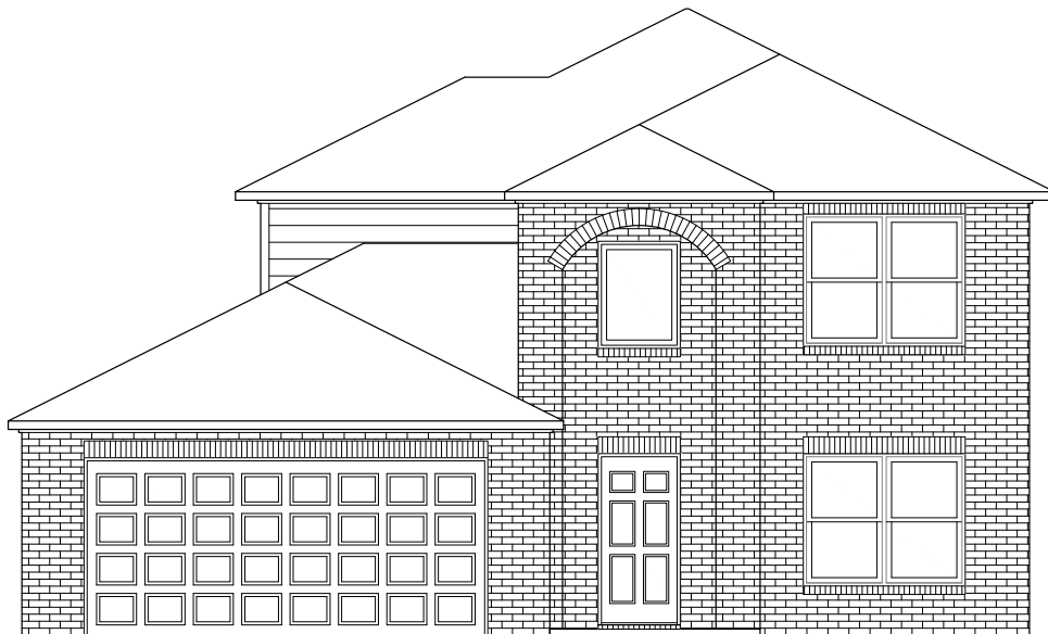
RC Hadleigh Elevation B