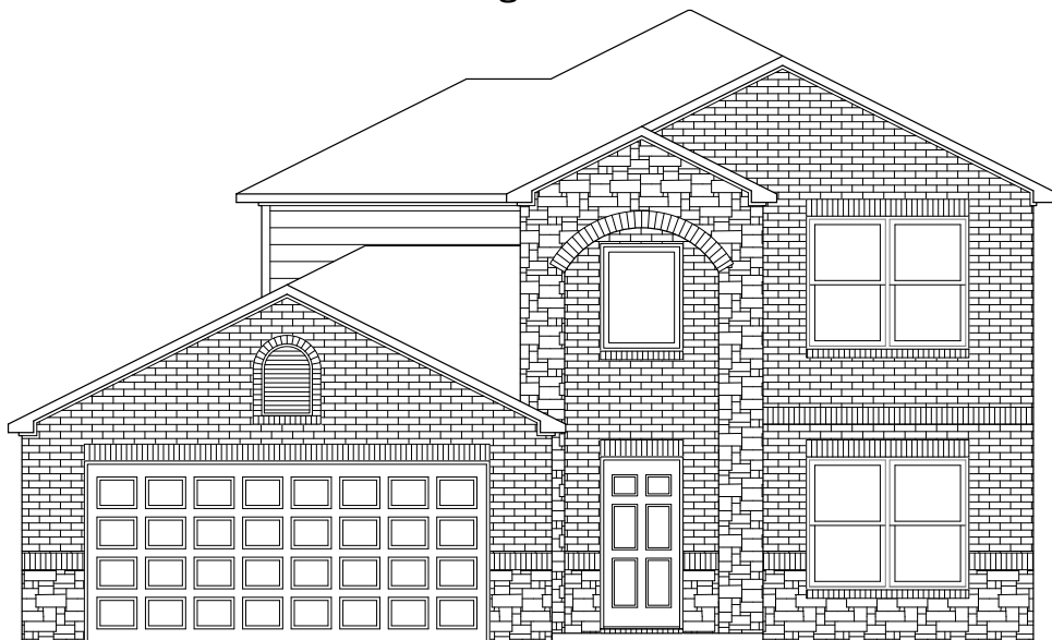
RC Hadleigh Elevation D