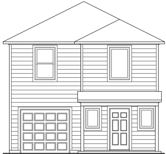
RC Drake Elevation G