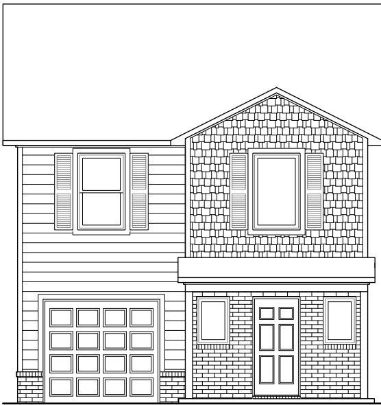
RC Drake Elevation C