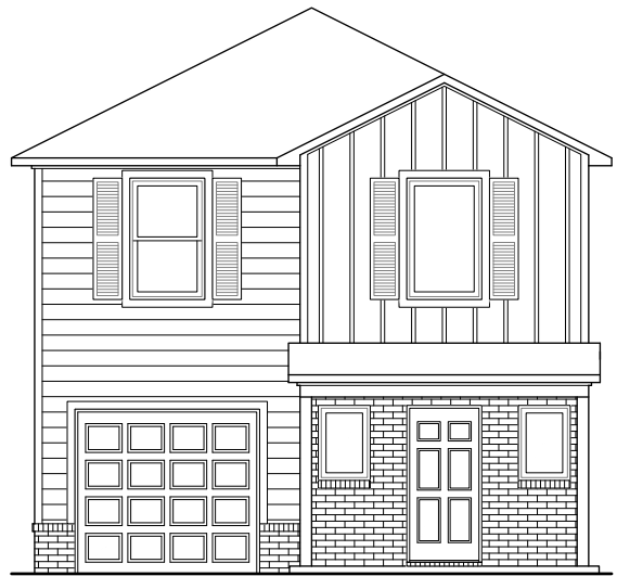
RC Drake Elevation B