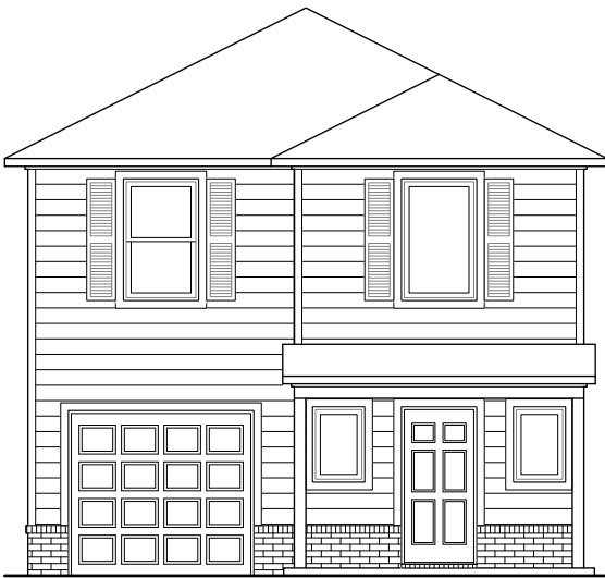
RC Drake Elevation A