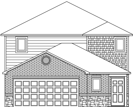
RC Conway Elevation D