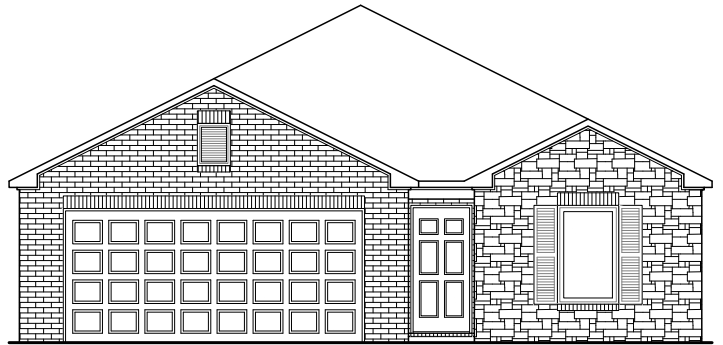
RC Wright Elevation F