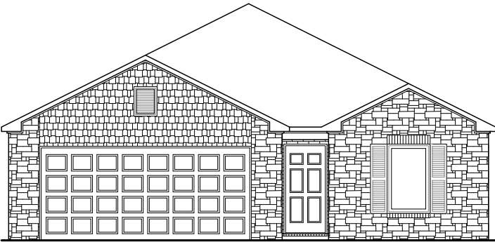
RC Wright Elevation E