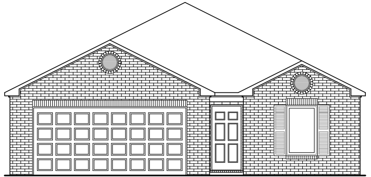
RC Wright Elevation D