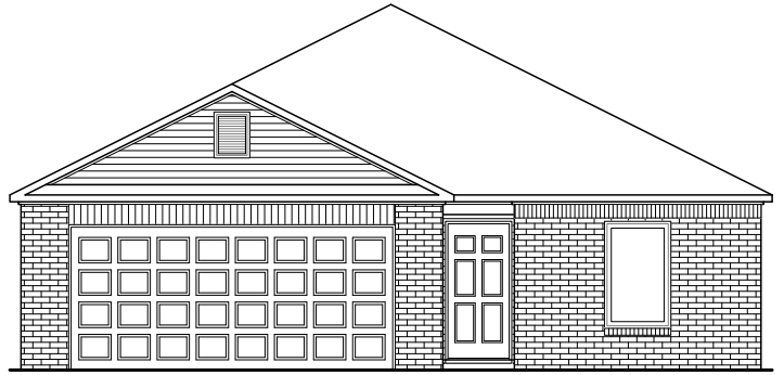
RC Wright Elevation B