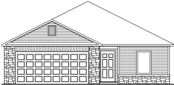
RC Wright Elevation I