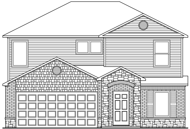
RC Walsh Elevation D