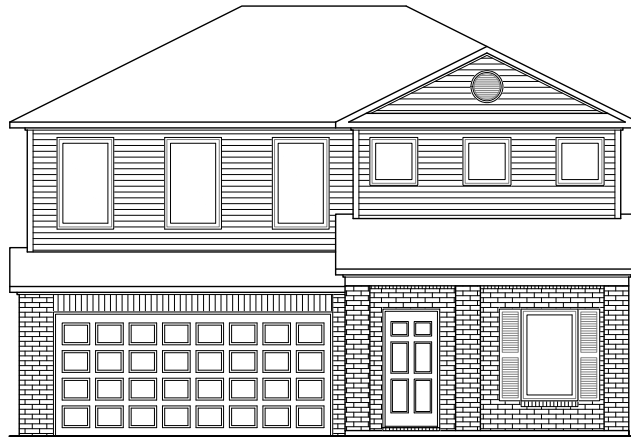
RC Walsh Elevation E