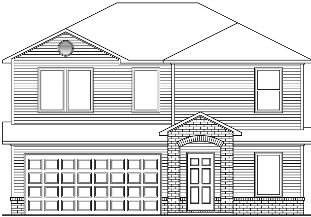
RC Walsh Elevation A