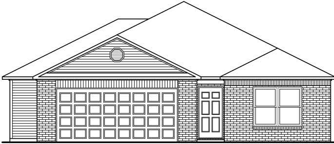
RC Taylor Elevation C