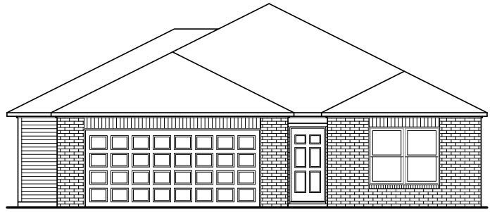
RC Taylor Elevation B