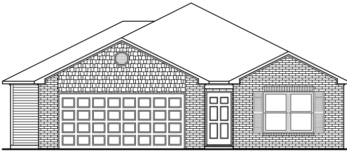
RC Taylor Elevation E