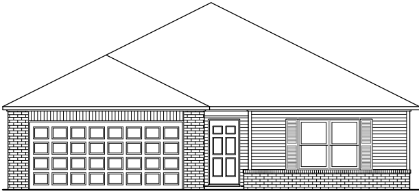
RC Ross Elevation A