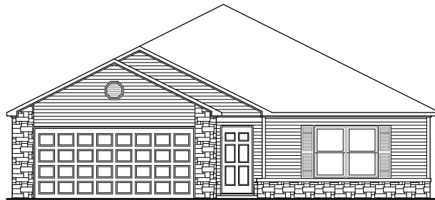
RC Ross Elevation I