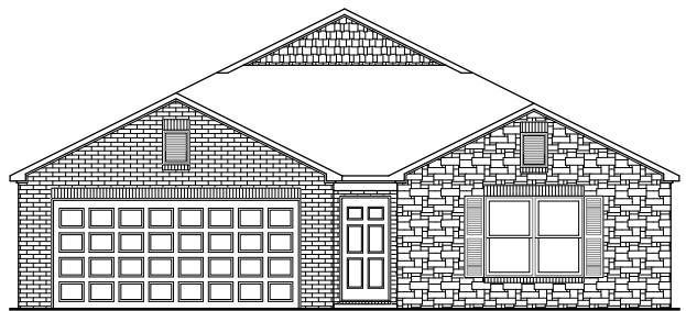
RC Ross Elevation F