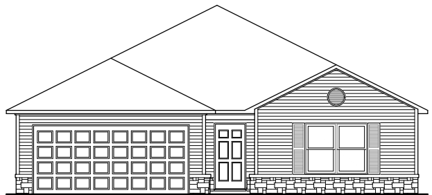
RC Ross Elevation H