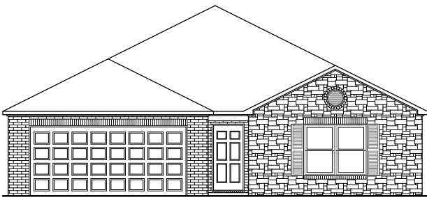
RC Ross Elevation E