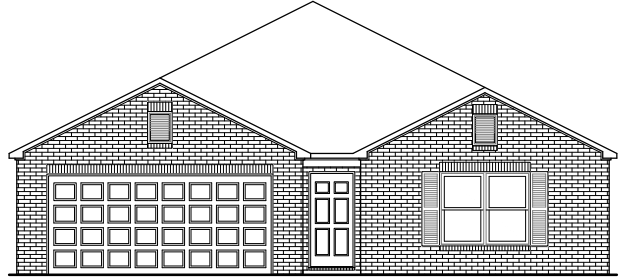
RC Ross Elevation D