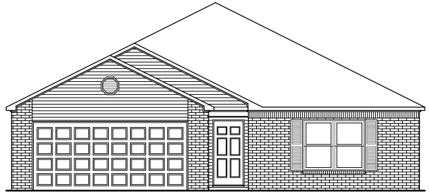
RC Ross Elevation B