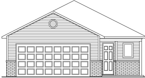
RC Ridgeland Elevation B