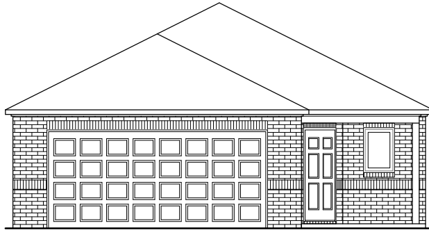
RC Ridgeland Elevation C