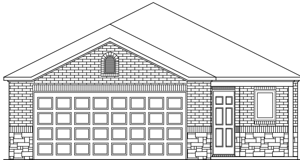
RC Ridgeland Elevation D