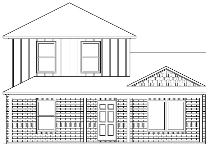
RC Quinn Elevation E