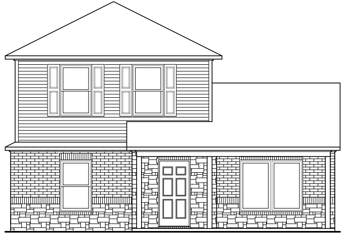
RC Quinn Elevation D