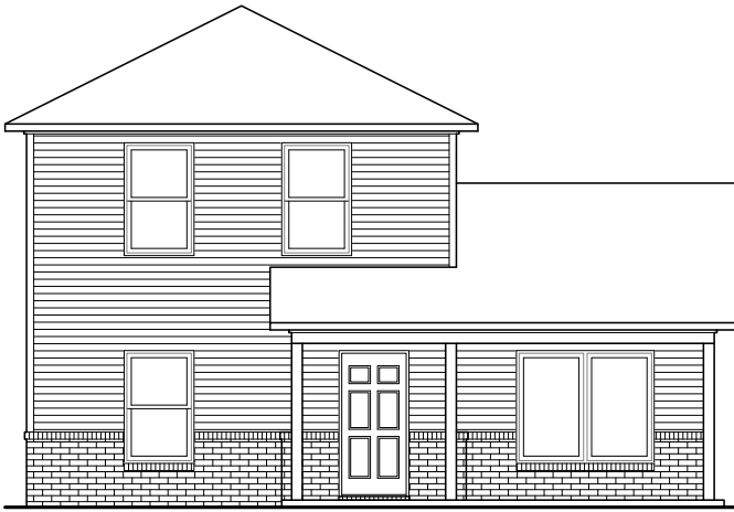
RC Quinn Elevation A