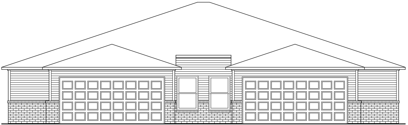
RC Preston Elevation A