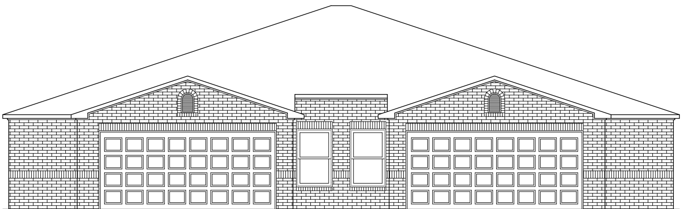
RC Preston Elevation C