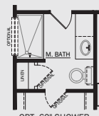
OPT. 60" SHOWER