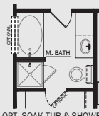
OPT. SOAK TUB & SHOWER