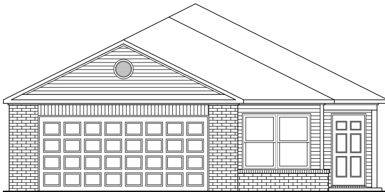
RC Pinehurst Elevation B