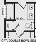
OPT. DOUBLE BOWL SINK