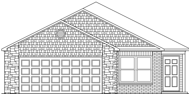
RC Pinehurst Elevation C