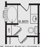
OPT. SOAK TUB W/ SHWR HEAD