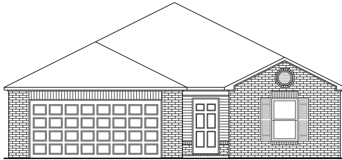
RC Murrow II Elevation C