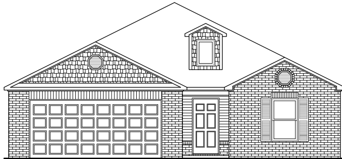
RC Murrow II Elevation D