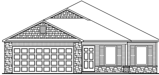
RC Morgan Elevation B