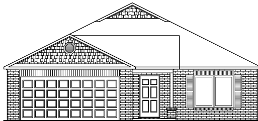
RC Morgan Elevation E