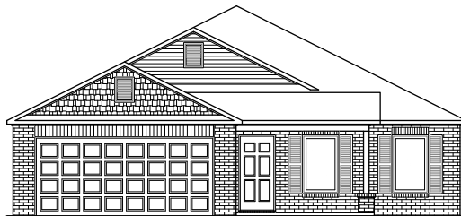
RC Morgan Elevation D