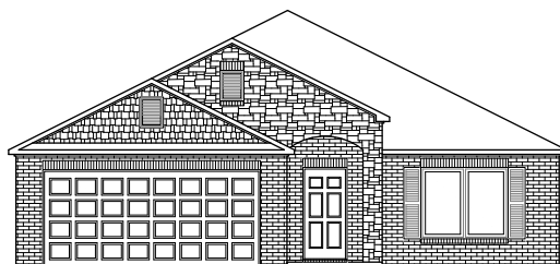
RC Morgan Elevation F