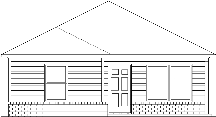
RC Monaco Elevation A