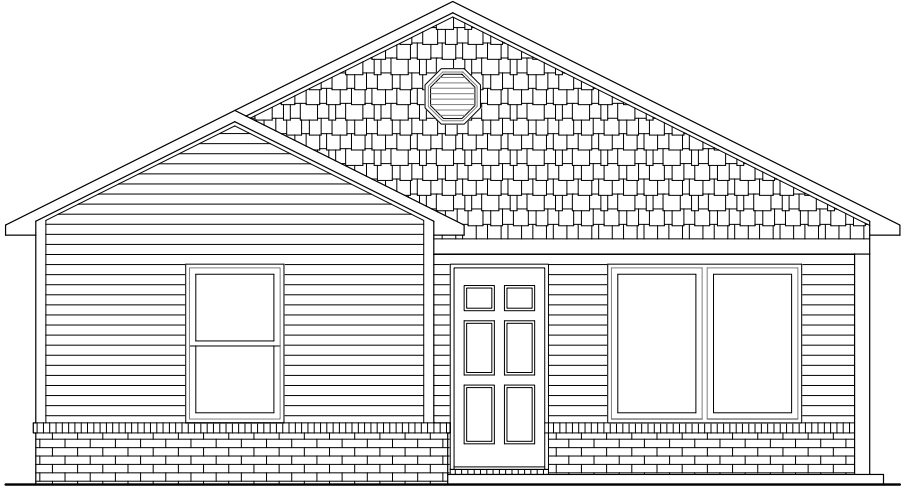
RC Monaco Elevation B