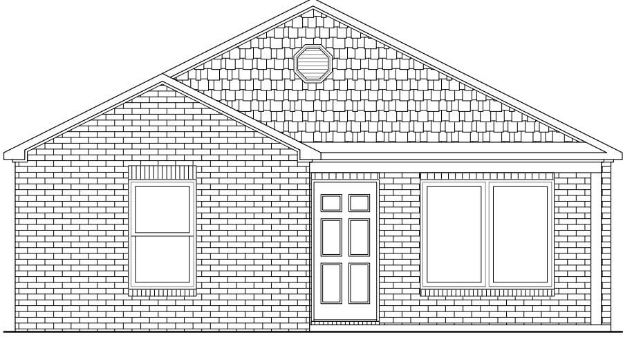
RC Monaco Elevation C