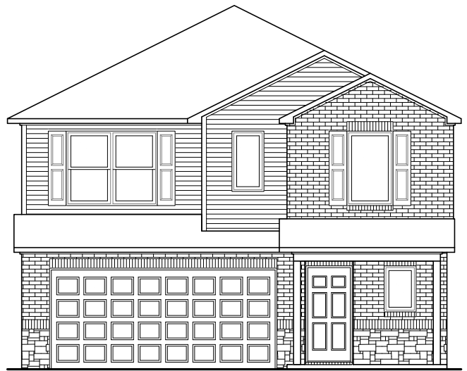
RC Manchester Elevation D