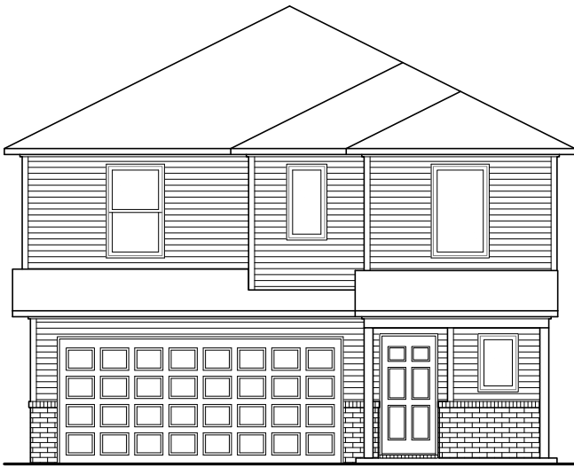
RC Manchester Elevation A