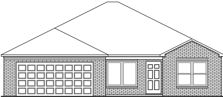
RC Lowell II Elevation H