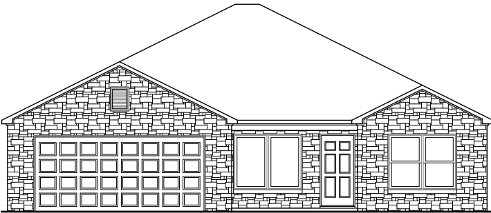
RC Lowell II Elevation I