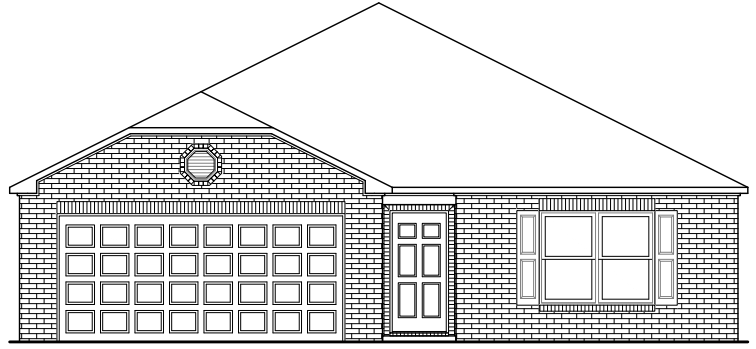
RC Fenway Elevation B