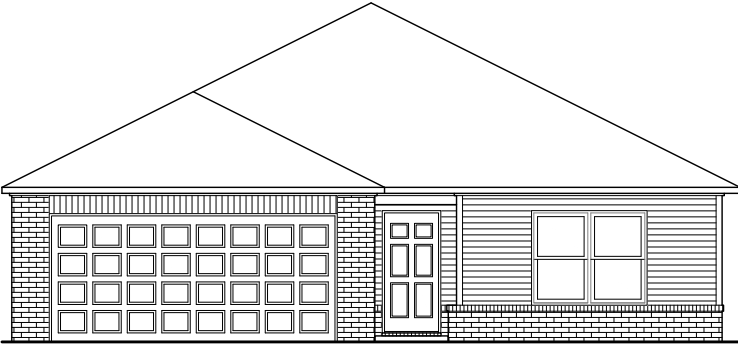
RC Fenway Elevation A