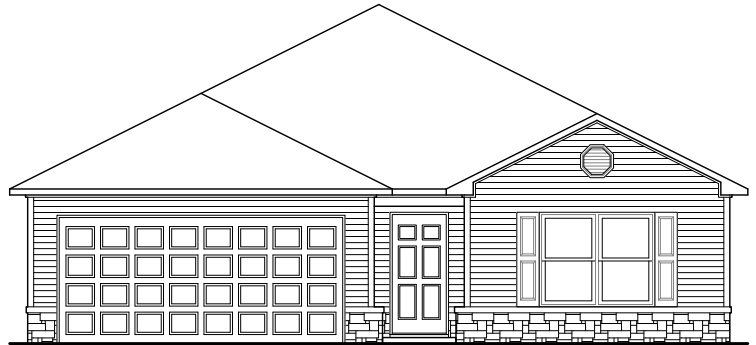
RC Fenway Elevation H