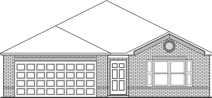
RC Fenway Elevation C