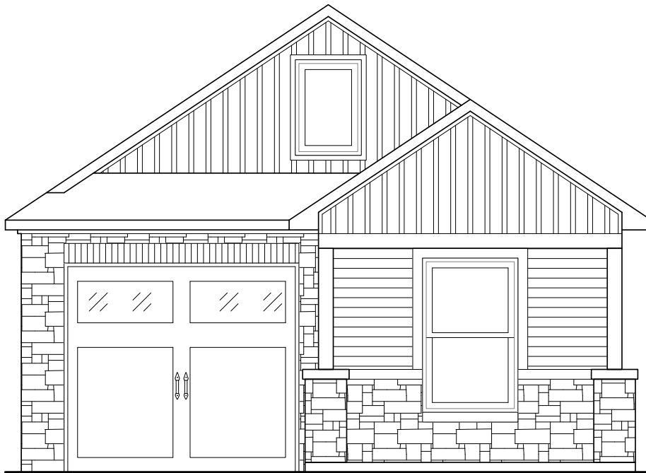
RC Everly Elevation C