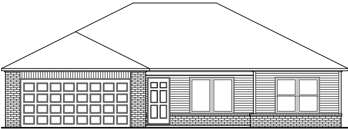
RC Clark Elevation A