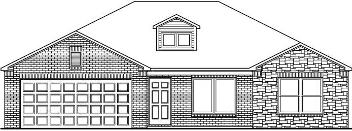
RC Clark Elevation F