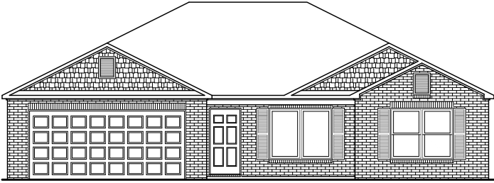
RC Clark Elevation E