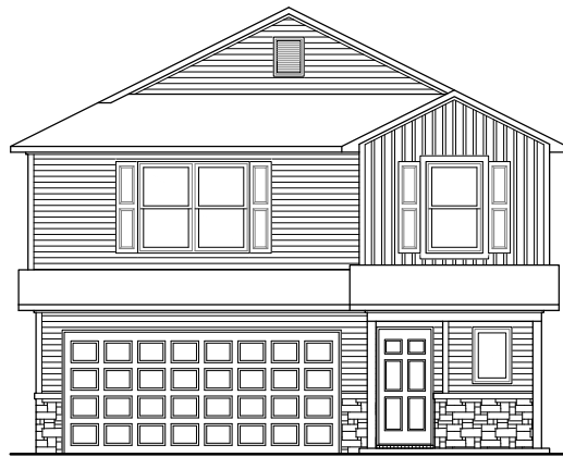
RC Chelsey Elevation I