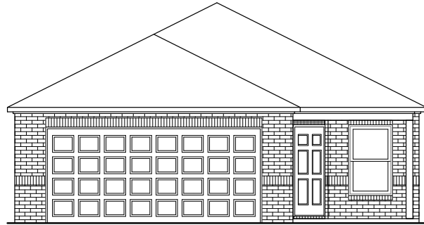
RC Carlie II Elevation C