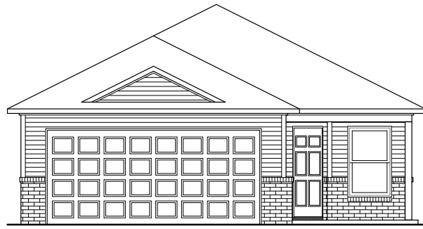
RC Carlie II Elevation A