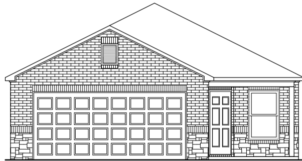
RC Carlie II Elevation D