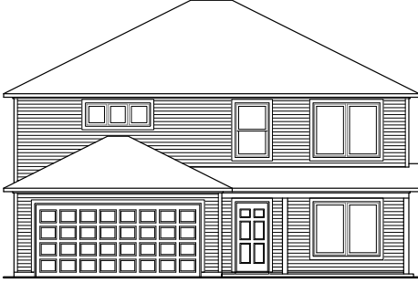
RC Bennet Elevation G