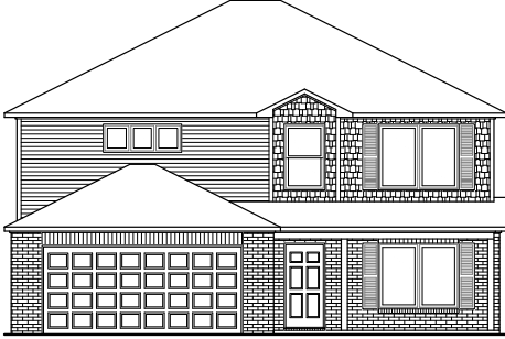
RC Bennet Elevation E