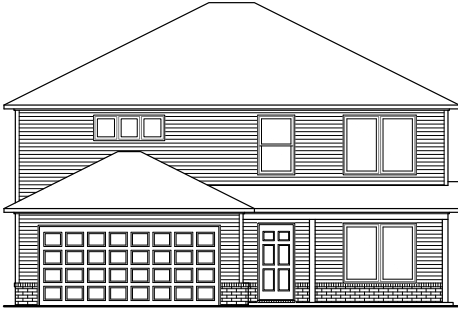
RC Bennet Elevation A