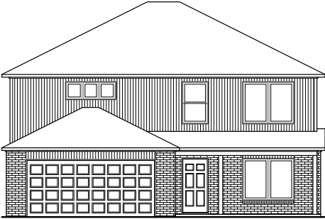
RC Bennet Elevation B