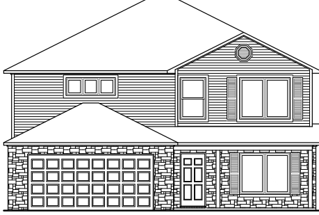
RC Bennet Elevation I