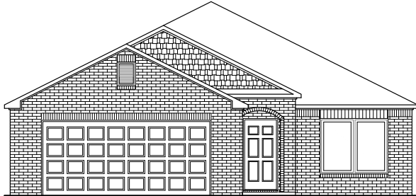
RC Baltimore Elevation B