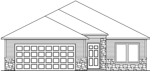
RC Baltimore Elevation H