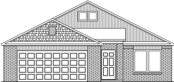
RC Baltimore Elevation C