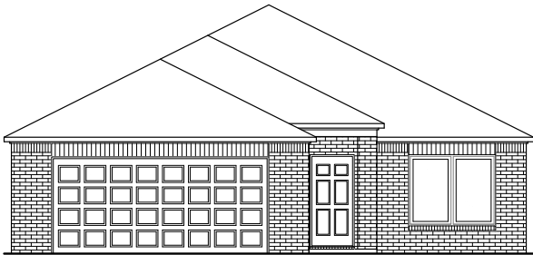
RC Baltimore Elevation A