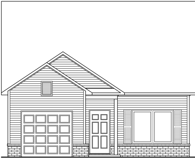
RC Avery Elevation A