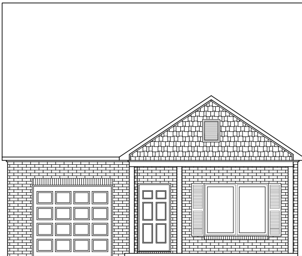
RC Avery Elevation C