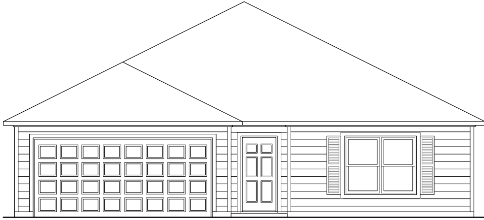
RC Ross Elevation G