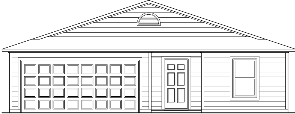
RC Rockford Elevation J