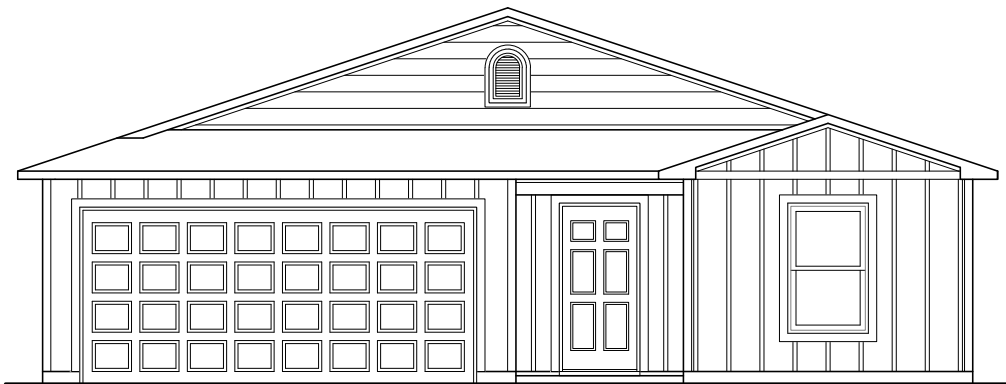
RC Rockford Elevation L