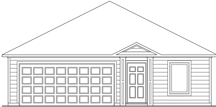
RC Hudson Elevation G