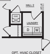
OPT. HVAC CLOSET