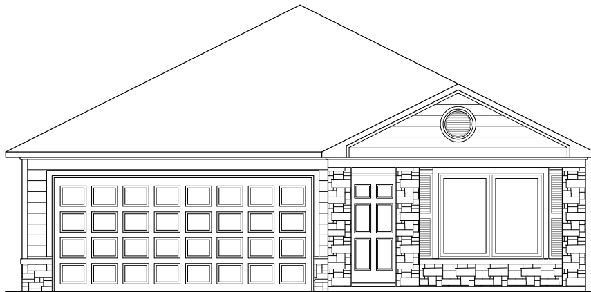
RC Hudson Elevation I