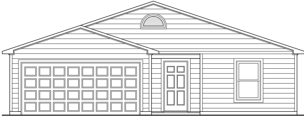
RC Greenfield Elevation J