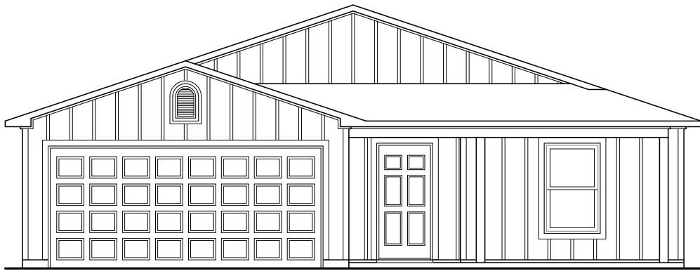
RC Greenfield Elevation L