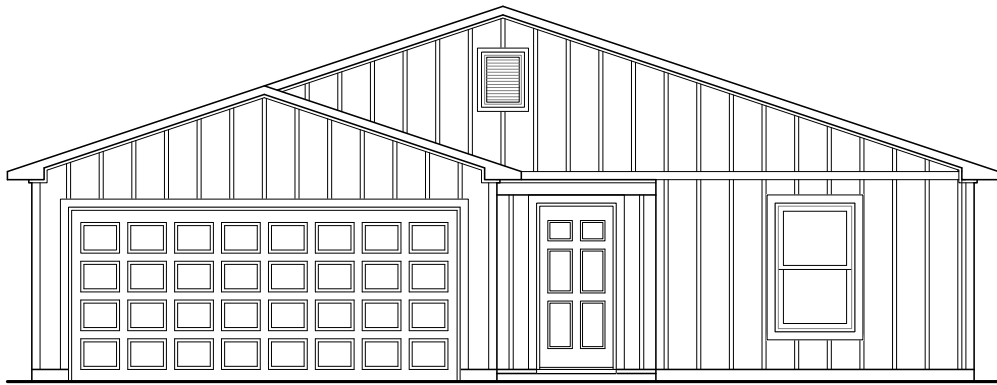
RC Greenfield Elevation K