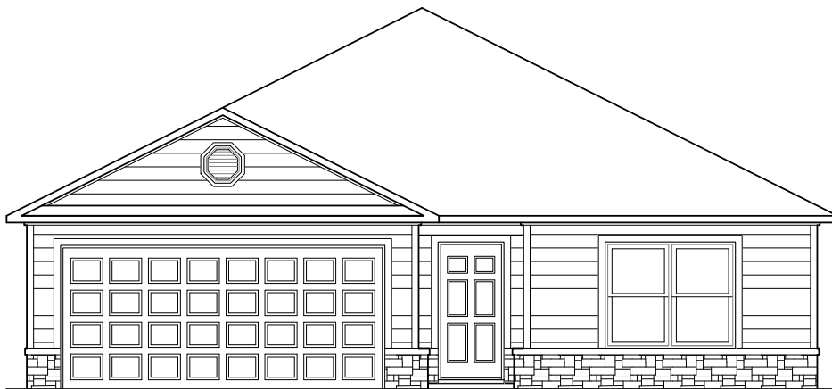
RC Foster II Elevation I