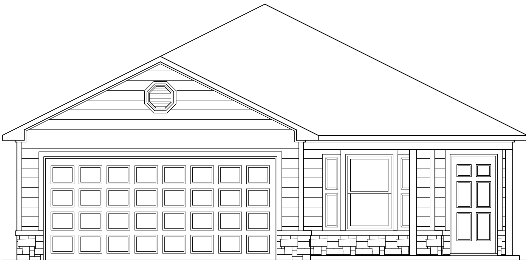
RC Bridgeport Elevation I