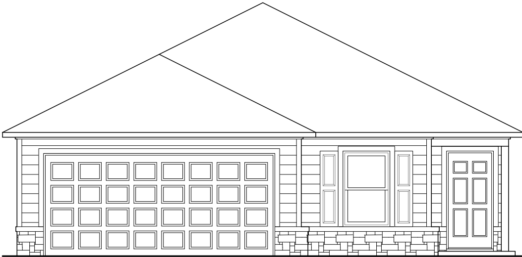
RC Bridgeport Elevation H